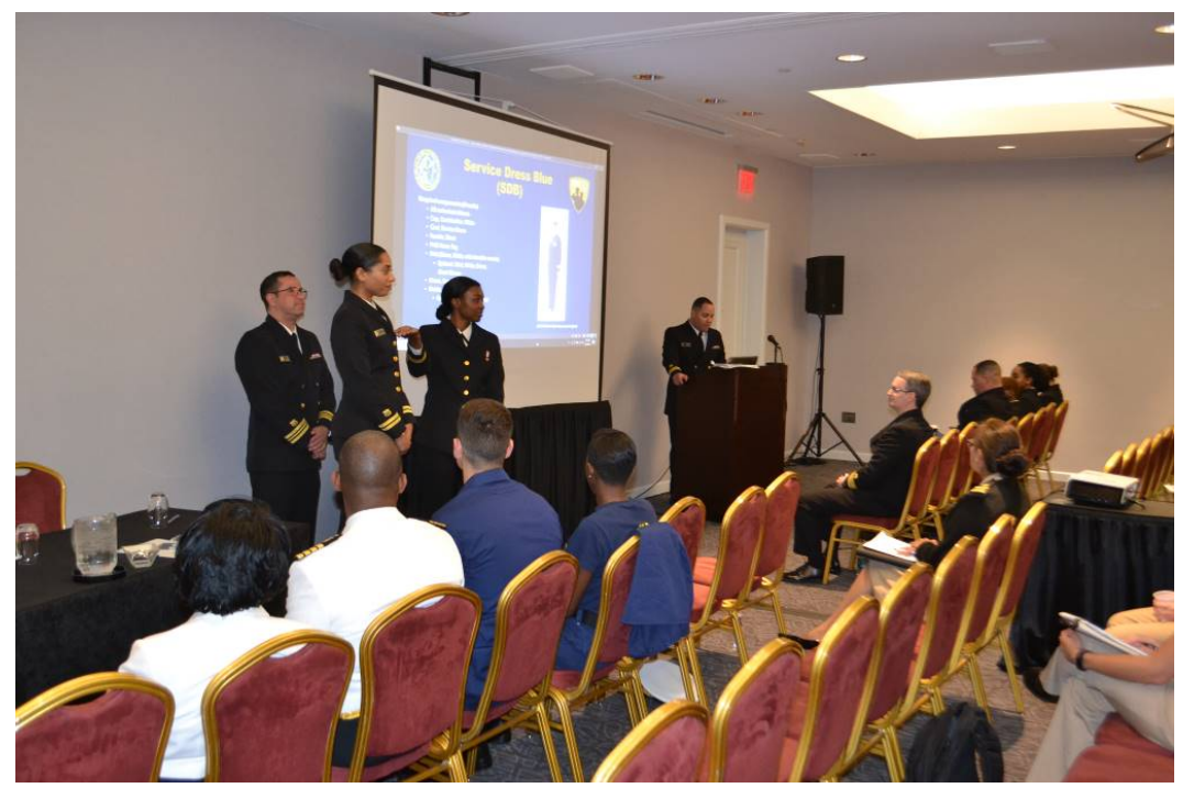
"Back to Basics" Uniform Presentation at 2018 USPHS Scientific and Training Symposium in Dallas, TX