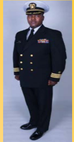
PHS Officer posing in Service Dress Blues

https://dcp.psc.gov/ccmis/ccis/documents/POM17_002.pdf