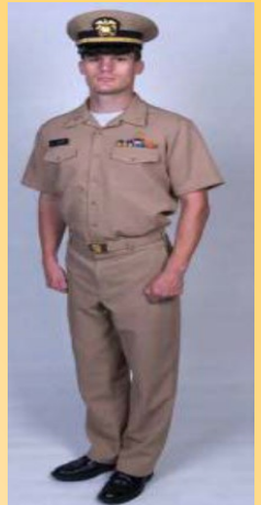
PHS Officer posing in Service Khakis