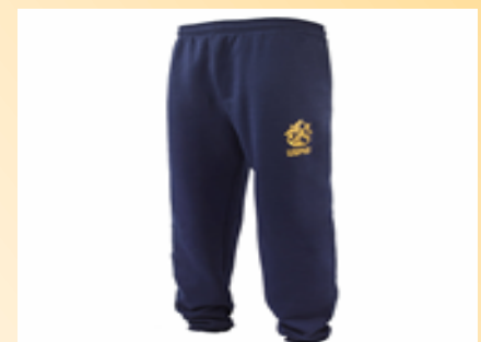
Optional PTU fleece sweatpants