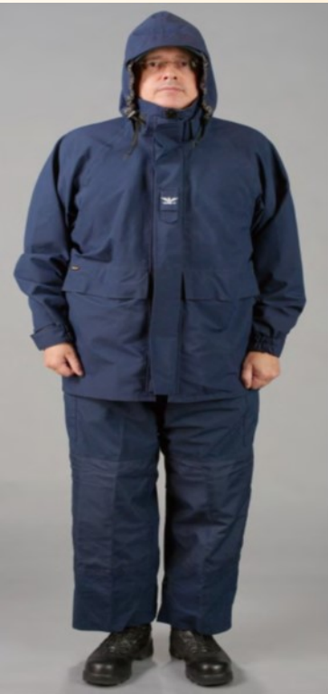
Example showing Foul Weather Parka, Type II and Trousers

The SDB is a general purpose uniform authorized for year-round wear to official functions or situations where the male civilian equivalent is coat and tie. Aside from the required basic components (which can be found in CCI 421.01 and 421.02), there are some authorized optional components that are popular modifications to the SDB. For instance, the black Navy V-neck sweater or the black windbreaker jacket may be worn over the shirt/blouse in lieu of the SDB coat. With both of these modifications, a black garrison cap is an optional alternative to the combination cap. A more recent modification allows female officers to wear flats as part of their Service Dress Uniforms.