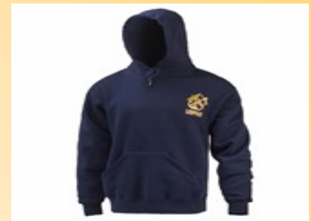
Optional PTU fleece hoodie