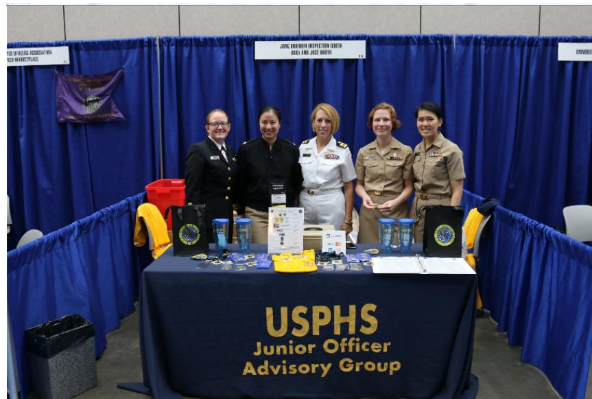
Junior Officer Career Enhancement Booth at 2017 Symposium