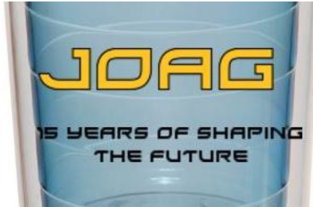
Tumbler with Winning Slogan