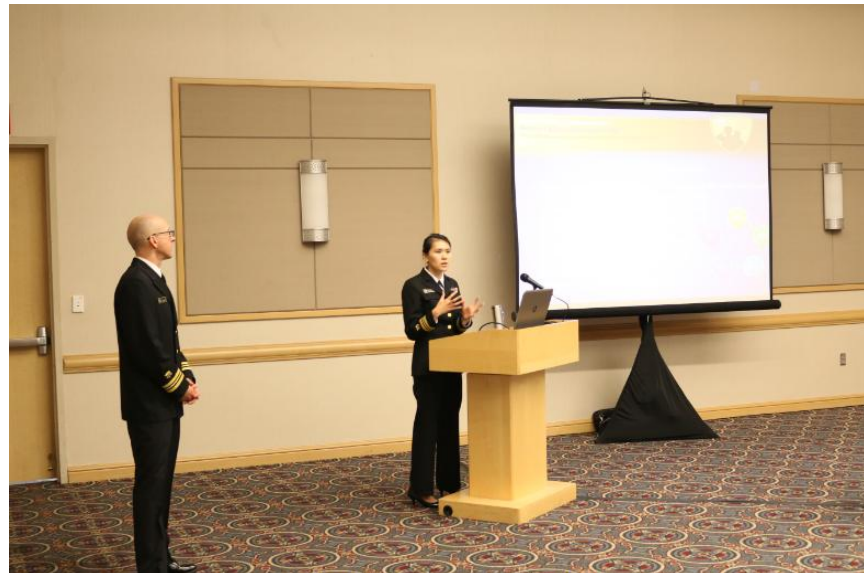
"How to Get the Most Out of JOAG" Presentation at 2017 Symposium