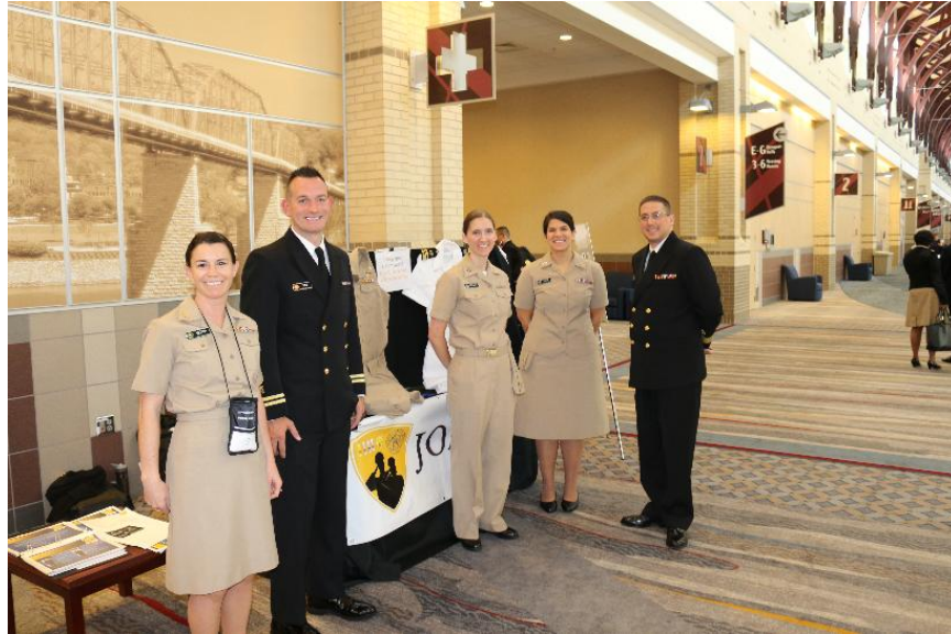
Uniform Inspection Booth at 2017 Symposium