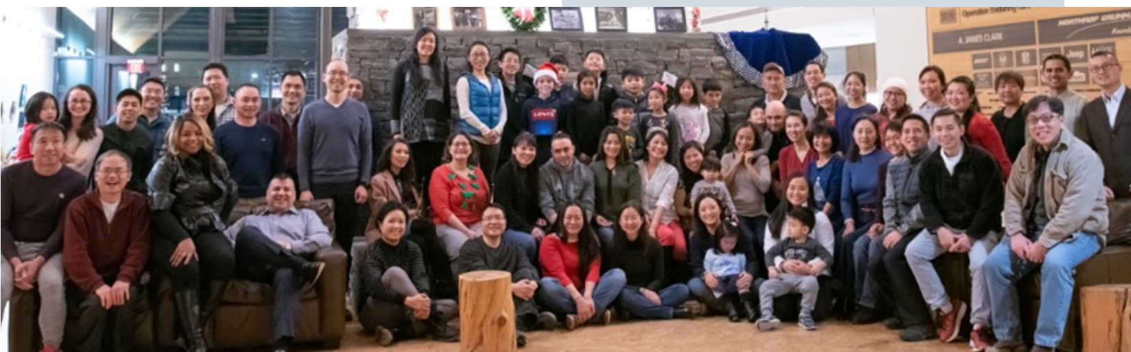
APAOC officers, friends, and families gathered at the USO Warrior and Family Center for the 2020 APAOC Leadership Transition Ceremony.