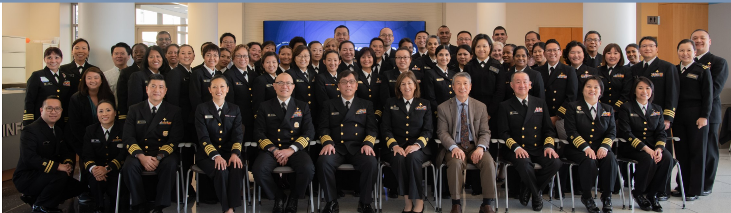
Distinguished guests, presenters, and participants at the 3 rd Annual APAOC Leadership Summit