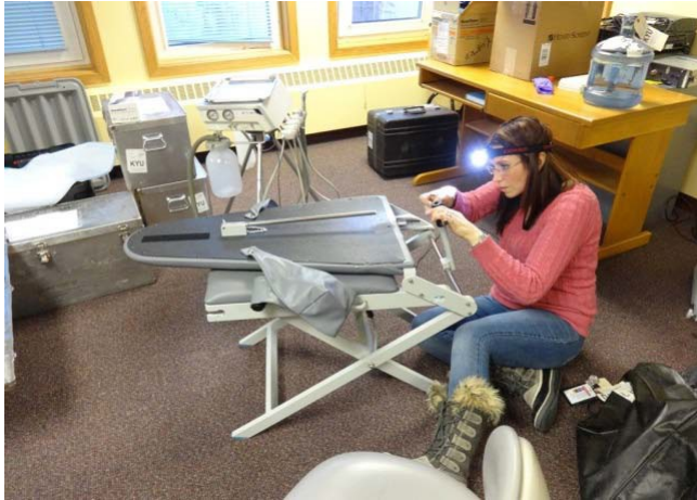
Repairing the dental chair

There are no hotels or restaurants in Koyukuk, so we brought cots, sleeping bags, and food. We packed enough food to last not only for the week but for the occasional times when our flights home might be delayed, mostly due to weather. For this trip, we worked and stayed in an elementary school classroom. The school is one of two places in Koyukuk that have running water. The other place with running water is the washeteria. The residents use the washeteria for laundry, showers, and fetching water to take to their houses for washing and cooking.