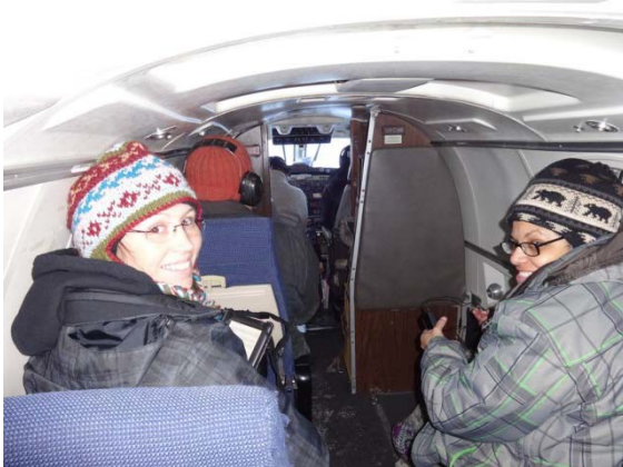
Two dental assistants in the single engine plane

My very first trip was to the village of Koyukuk from Monday December 1 st to Friday December 5 th . Koyukuk is a small city with a population of about 95 people with 42 households, 24 of which are families. The city is not accessible by roads. The residents are primarily KoyukonAthabscans with a subsistence lifestyle. Some of them work at outside jobs, such as teachers, health aides, tribal council members, custodians, power and water maintenance workers, oil field workers, public safety officers, and others. However, many depend on hunting and fishing for nutrition and cultural practices.