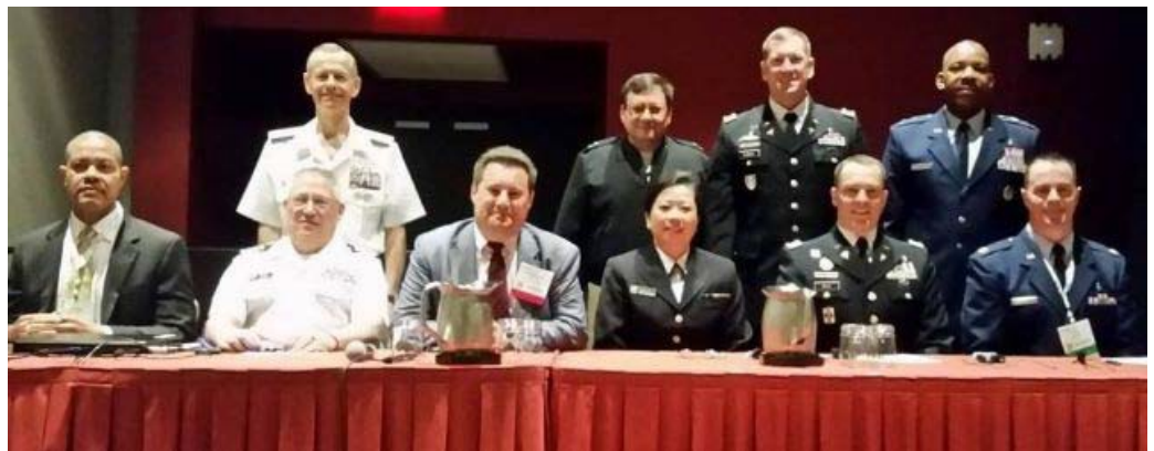
Federal Services Panel

As is anticipated for ADA delegates, a majority of our time and energy was dedicated to the actions and concerns of the ADA House of Delegates (HOD), starting with its official opening ceremonies held on Friday afternoon in the Convention Center. As the legislative and governing body, the House of Delegates is the supreme authority in the American Dental Association. As such, it speaks for the 158,000 dentist members of the Association and for the dental profession in the United States. The San Antonio meeting