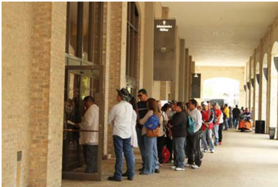
ADA coordinated Missions of Mercy event. People are lining up for free dental services.

For the second year, annual meeting attendees gave back by volunteering for the ADA Mission of Mercy free dental clinic all day Sunday from 5:30 a.m. - 5:30 p.m. A handful of patients began lining up Saturday evening and by 7:45 a.m. Sunday, the line of patients waiting for dental care wrapped from Market Street around the corner on Alamo Street around two sides of the Henry B. Gonzalez Convention Center. This year's event employed 930 volunteers (including 161 dentists from San Antonio and across the U.S.), ready to mask and glove up to give back to the