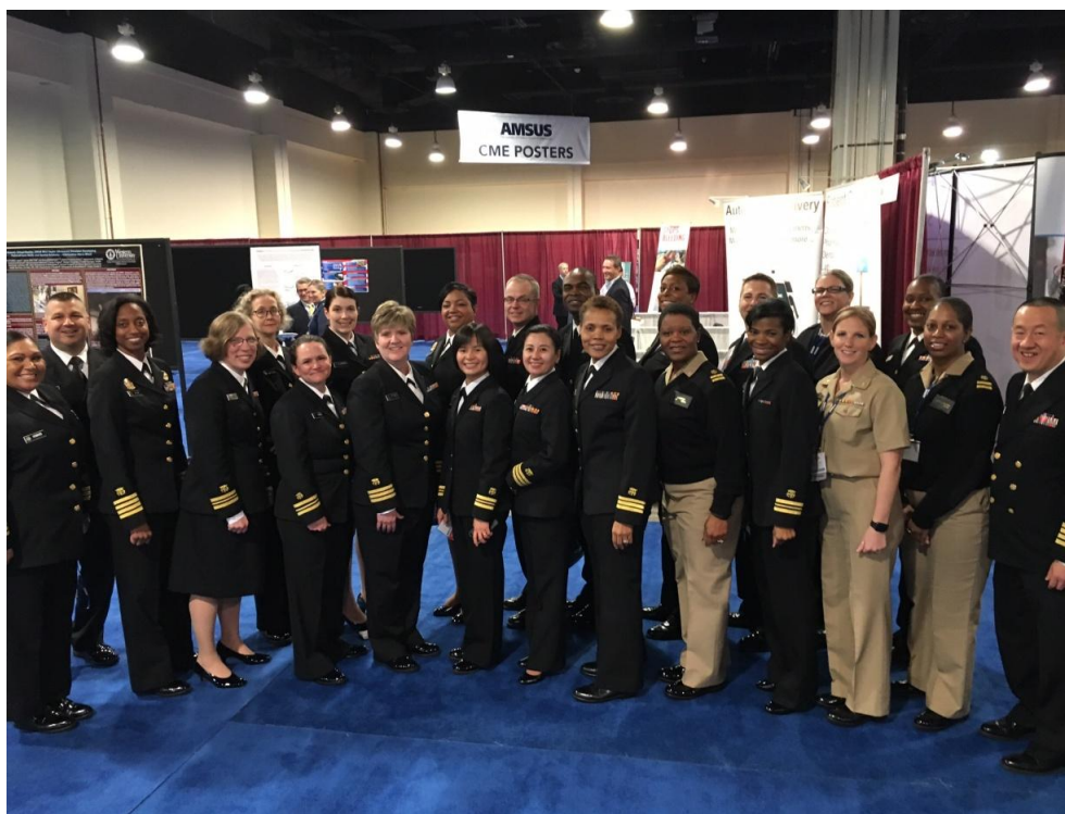
USPHS Officers attending the 2016 AMSUS Continuing Education Meeting at the Gaylord Convention Center, National Harbor, MD.