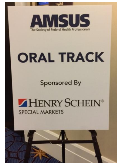
Henry Schein sponsored networking & snack break

Special purple pens marketing the Oral Track Session were handed out to all AMSUS attendees. Purple was used for two reasons - purple represents the military collaboration signifying collaboration on all levels and purple is used for the Dental profession. Attendance was higher than expected with 30 constant attendees at any given time and 50 total attendees for the entire 4 hour continuing education (CE) session.