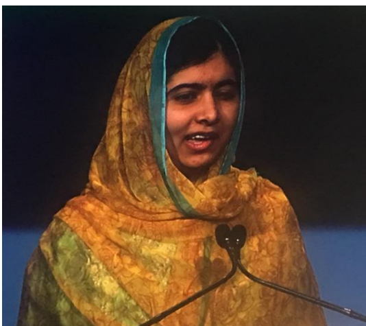
The ADA Distinguished Guest Speaker: Malala Yousafzai

Malala Yousafzai, the youngest Nobel Peace Prize recipient and a global activist for girls' educational rights, was the distinguished speaker. She attracted international attention in 2012 at the age of 10, after being shot by the Taliban in a school bus in northern Pakistan. Malala's speech was informative, inspirational, and delivered with a level of maturity not expected from someone so young. After the speech, there was an opportunity to text a donation to the Malala fund for refugee children's education.