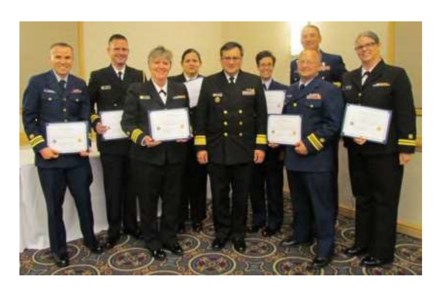
RADM Makrides with the 2017 Dental Category Day Planning Committee.

The 2018 USPHS Scientific and Training Symposium will be held in Dallas, Texas in June 2018. Please visit the Symposium website (http://symposium.phscof.org/) for updates on the upcoming 53rd Annual Symposium.