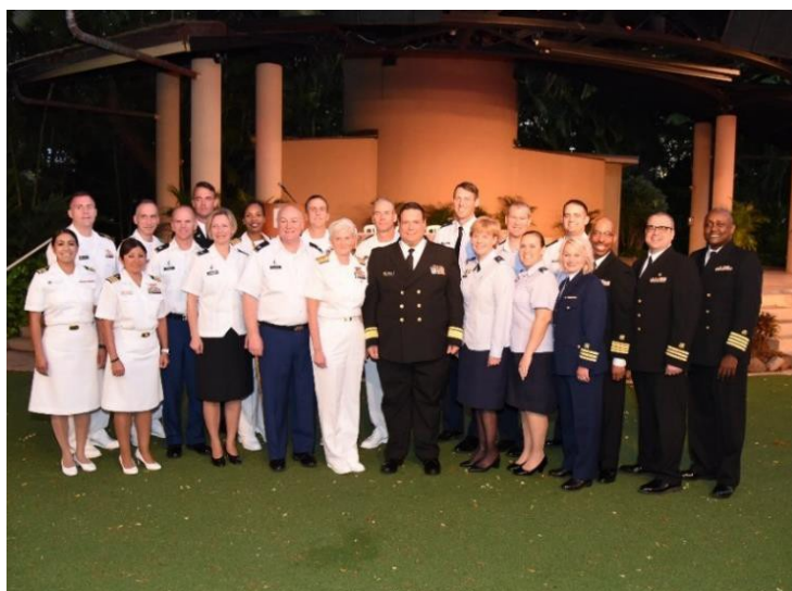
Federal Dental Services Reception at the 2018 ADA Annual Meeting, including USPHS dental officers and representatives from the U.S. Navy, U.S. Army, U.S. Air Force, and Veterans Affairs.