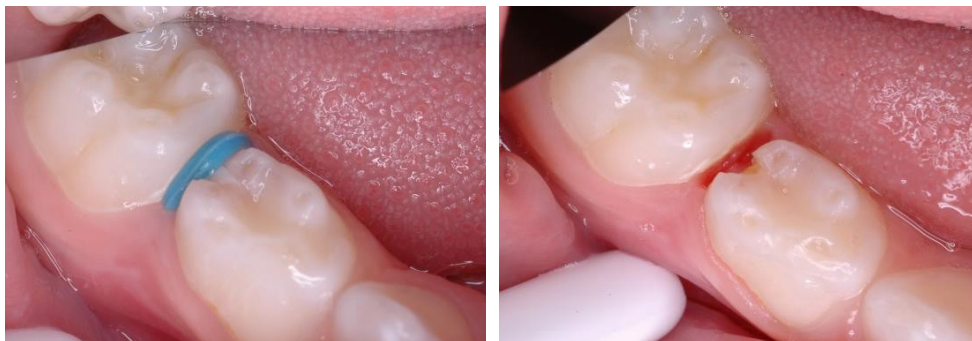
Before and after separating elastic.