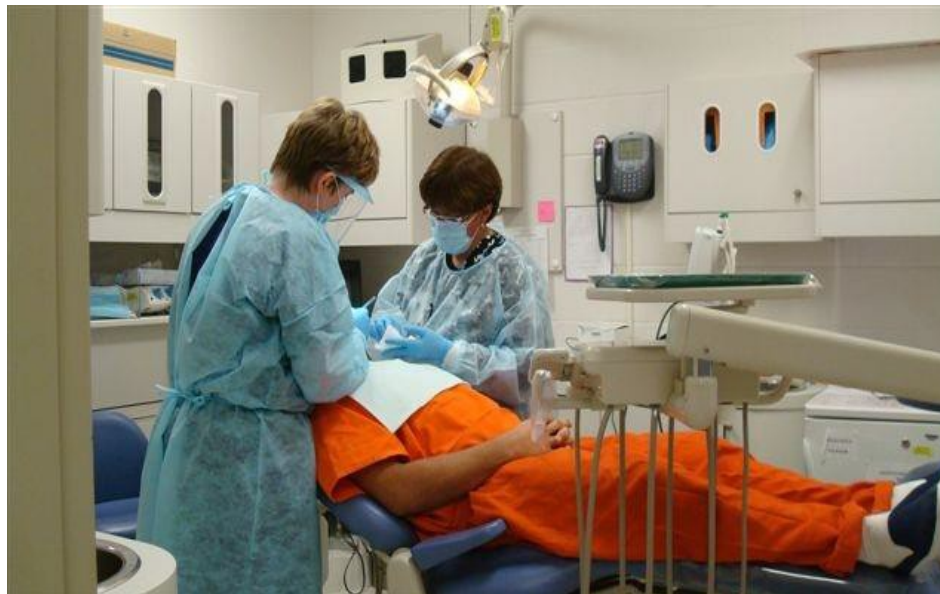
Members of the Pearsall Dental Team hard at work

It's a privilege to be able to meet and help people from all over the world, and the opportunity to work alongside our dedicated and compassionate dental staff makes it all that much more rewarding. To learn more about IHSC please visit our website and feel free to contact me with questions.