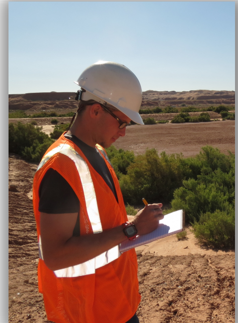
JRCOSTEP surveying sewer lagoon

"I have participated in several internships, but my JRCOSTEP experience has, by far, been the most fulfilling and empowering. Furthermore, my past experiences do not match the level of support, guidance, and encouragement that I have witnessed and received within the USPHS."