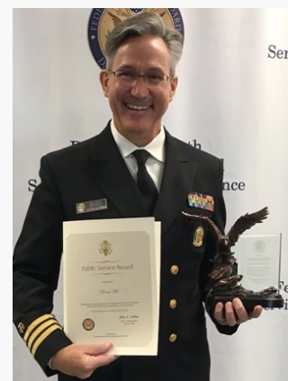
Figure 7. CDR Bird