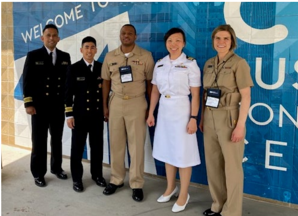
Dental Hygienist Officers displaying an amalgamation of PHS uniforms.