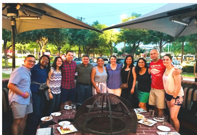
Officers enjoy an evening of networking and fun at the social.