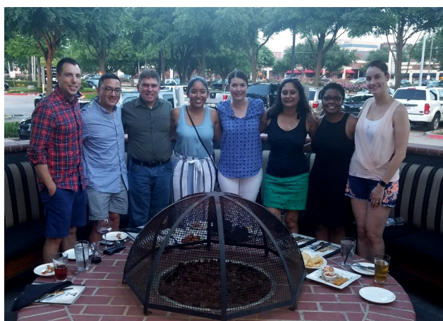
Officers relax during the 2018 PHPAG social in Dallas, TX.