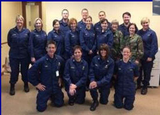
Above: Rapid Deployment Force (RDF) Team 4 holds Team Meeting and Training, October 18, 2014 in Oklahoma City, OK