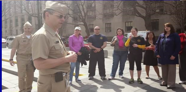
Above and below: Acting Surgeon General, RADM Boris D. Lushniak, MD, MPH, rallies USPHS Officers and HHS staff during National Walking Day to promote the SG's Every Body Walk! Initiative in Washington, D.C.