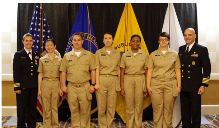
Scientist Officers at the Officer Basic Training Course with the Director of Office of Force Readiness and Deployment

If you have questions about COSTEP, please visit our website at http://www.usphs.gov/student/ .