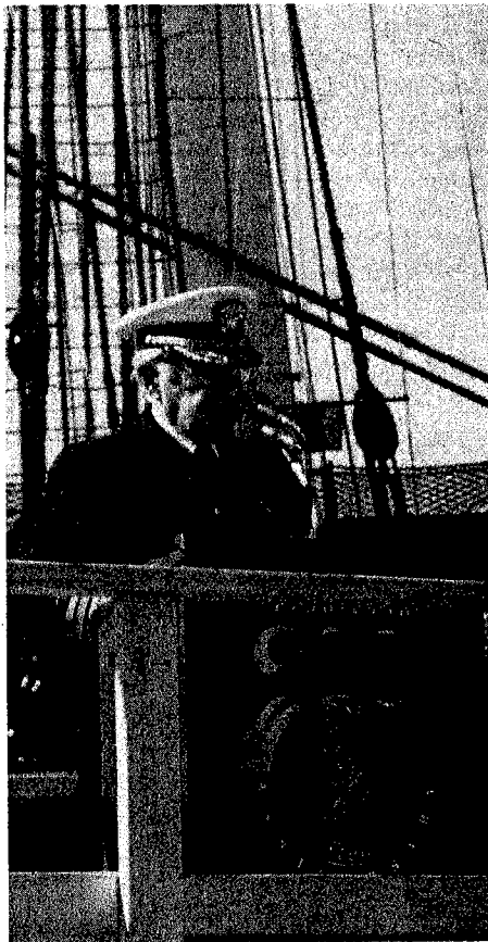
Former Assistant Secretary for Health and Surgeon General Julius B. Richmond at the podium in Boston.

Other highlights of the program included readings of congratulatory proclamations from the Commonwealth of Massachusetts and the City of Boston and the presentation of the first "Julius