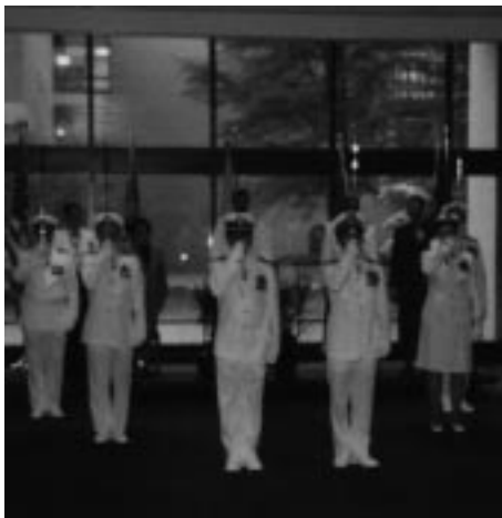
Public Health Service Commissioned Corps Sword Honor Guard

For those attending ceremonial functions in the Washington, D.C. area, the presence of the Sword Honor Guard (SHG) is not an uncommon sight. The SHG members, equipped with the U.S. Public Health Service (PHS) Sword and wearing the Full Dress Uniform, serve in rendering honor to senior-level personnel and events in a most unique manner.