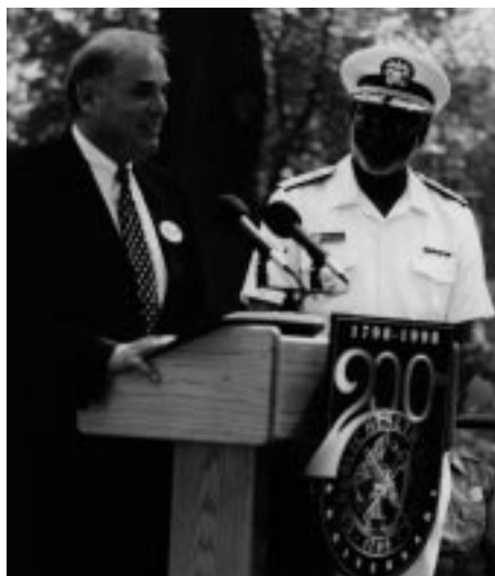
Philadelphia Mayor Edward G. Rendell presents a proclamation to Assistant Secretary for Health and Surgeon General David Satcher.

On July 16, 1798, two hundred years ago, President John Adams signed a law in Philadelphia, then the Nation's capital, that ultimately led to the formation of the U.S. Public Health Service (PHS). The 1798 act for the relief of sick and disabled seamen established a system of hospitals for merchant seamen that formally became the Marine Hospital Service in 1870. Expansion of the duties of the Service in the late 19th century to include such public health activities as quarantine and medical inspection of immigrants led to a change of name in 1902 to the Public Health and Marine Hospital Service, and again in 1912 to the Public Health Service.