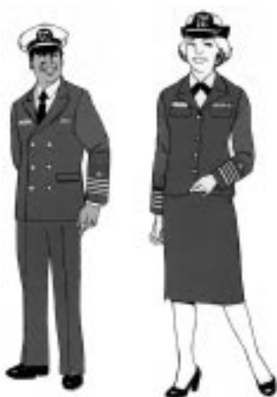
Service Dress Blue Uniform

A reminder of the proper wear of the Service Dress Blue, Service Dress Blue Sweater, and Summer Blue uniforms is included in this issue of the Commissioned Corps Bulletin . Below are drawings reproduced from Commissioned Corps Personnel Manual Pamphlet No. 61, "Information on Uniforms," along with the list of required basic uniform components, prescribable items, optional items, and occasions for wear.