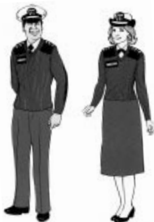
Service Dress Blue Sweater Uniform

Year-round at all official functions or situations where formal dress or full dress uniforms are not prescribed and civilian equivalent dress is coat and tie.