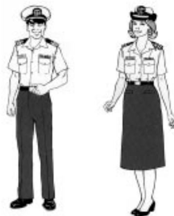
Summer Blue Uniform

Normal office work at duty station and in public places not requiring a more formal uniform.