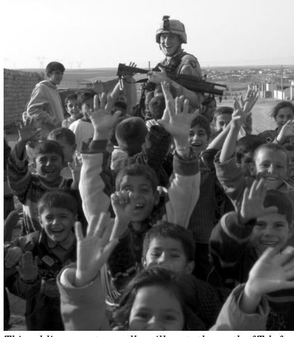
This soldier was at a smaller village to the north of Telafar. This is the type of reception often received from the children.