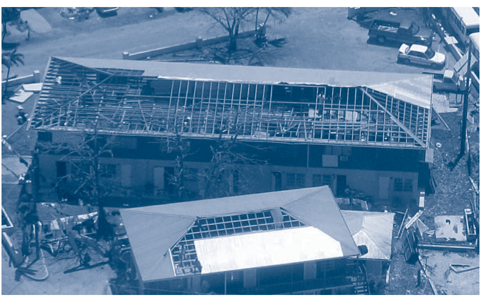
A view of the damage and destruction caused by the hurricane.

Many were celebrating the rescue, asking to take pictures with me, and the children were playing around. One passenger flagged me and said that she was hypoglycemic and was feeling dizzy. I quickly assessed her and gave her orange juice and kept an eye on her. One case in particular caught my attention. It was a mother with two children who was profusely crying as she looked out the window. Her children had not noticed and were laughing and playing. I approached