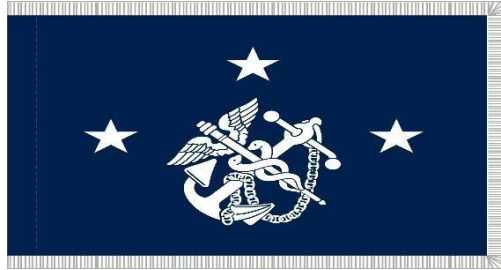
Deputy Surgeon General's Flag (Indoor Type with white fringe)