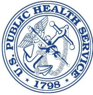
New One Color (Outline) Version