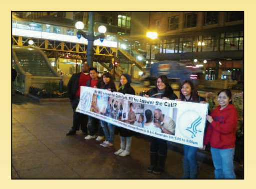
EVP winners from the University of Illinois

During the 2011 fall semester, the U.S. Public Health Service (USPHS) Commissioned Corps teamed up with EdVenture Partners (EVP), an organization dedicated to developing innovative industry-education partnerships, for a unique recruitment effort. The Commissioned Corps recruitment team routinely employs innovative measures to increase awareness of the Corps, which in turn assists in attracting quality, highperforming candidates for commissioning. The pilot recruitment campaign was launched at five universities across the nation, targeting high-priority health professions.