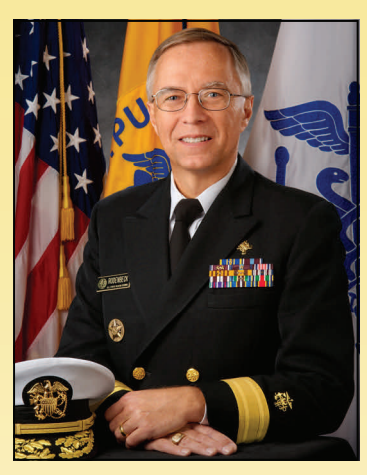
Rear Admiral Sven Rodenbeck

AC: What presentations/speeches have you given recently?